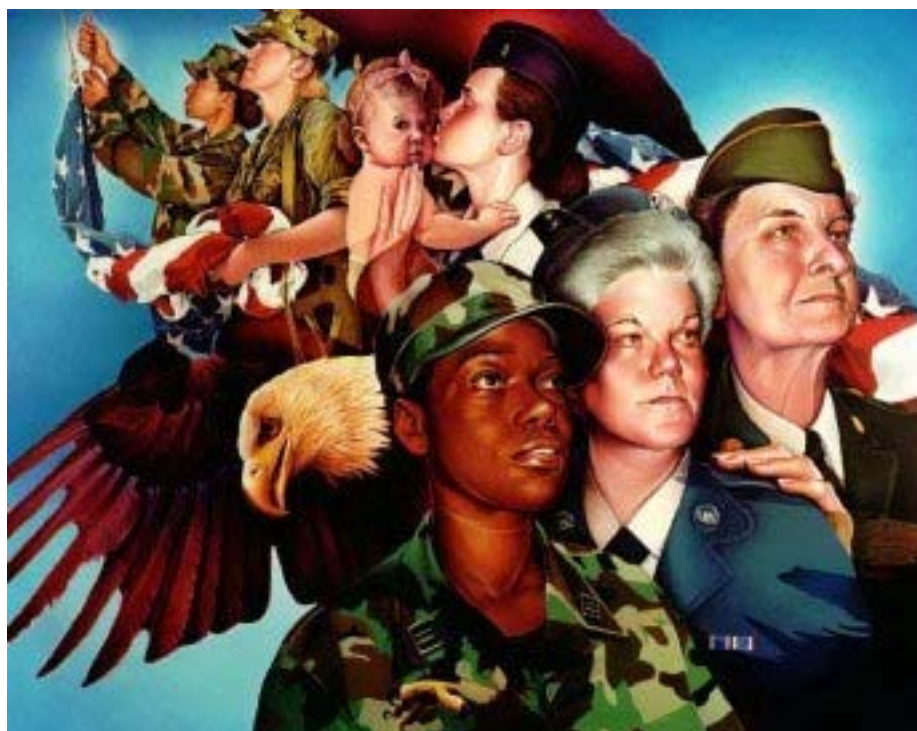
Our Women Veterans