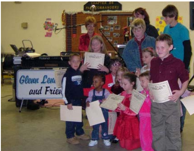
Junior Members receive recognition in Lufkin