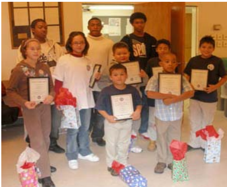
JUNIOR MEMBERS DAVA UNIT 17 RECOGNIZED FOR THEIR VOLUNTEER HOURS AT THE VA