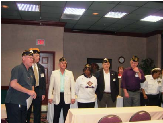
District II DAV Officers elected & Installed