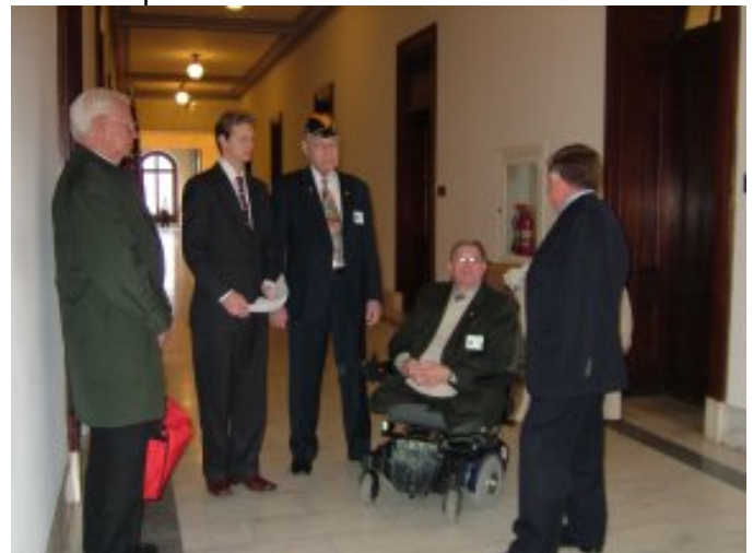
A group of Texans outside Senator Kay Bailey Hutchisons' office. She is a member of the Veterans Affairs Committee and this group was there to deliver a message.