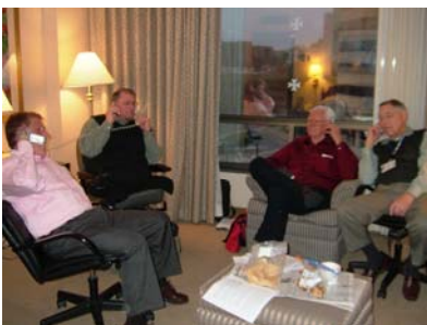
More Mid-winter politics in Washington