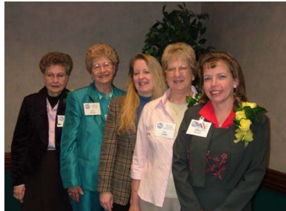
Dist II DAVA Officers elected