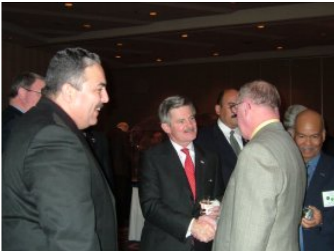
VA Secretary Nicholson attended the DAV Commander's Reception.