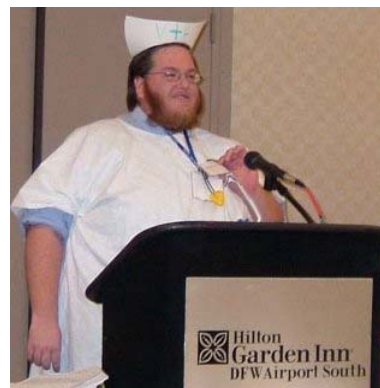
DAVA STATE SCHOOL TEACHER