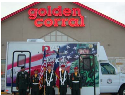
JROTC COLOR GUARD