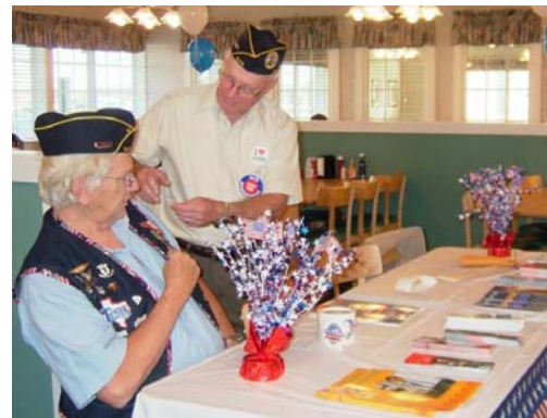
GOLDEN CORRAL 2006